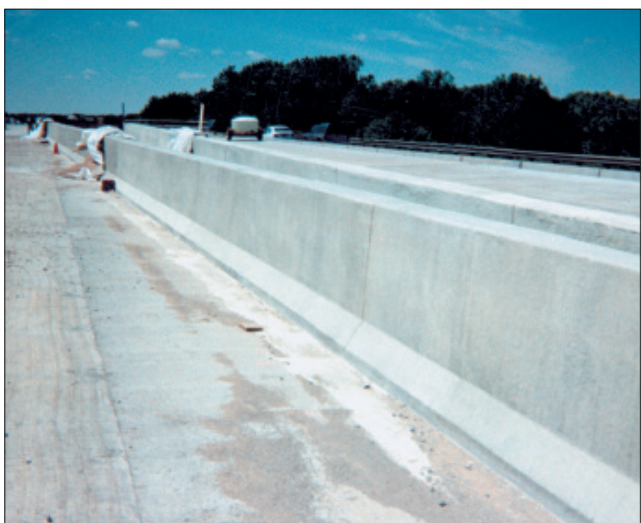
With the 5700-B on the road so much pouring parapet as well as curb and gutter, reliability is a key, says Kelvin Long, machine operator