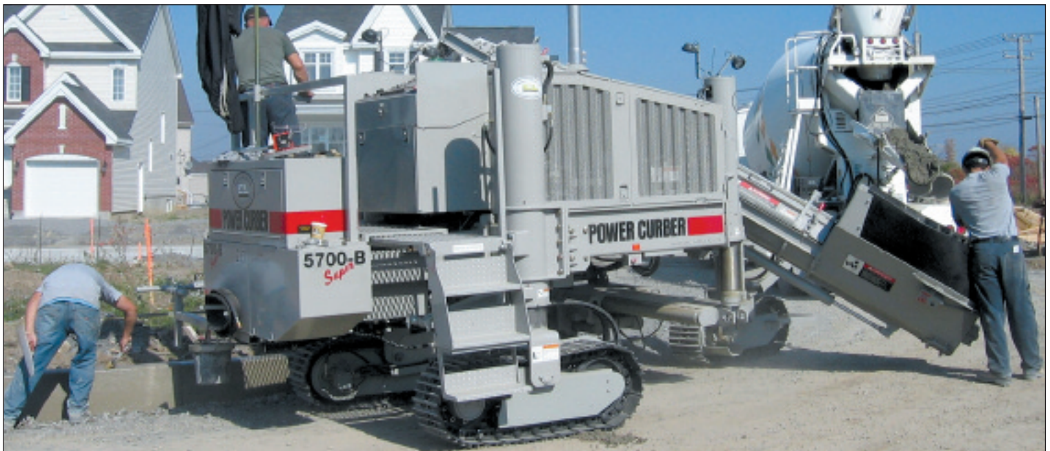
Ciments Lavallee Ltd. works with 7 slipform machines, including its new SUPER-B, with 80% of the work in curbs and 20% in Jersey barriers

Compact, With Low Center of Gravity: 'We can talk to each other without screaming.'