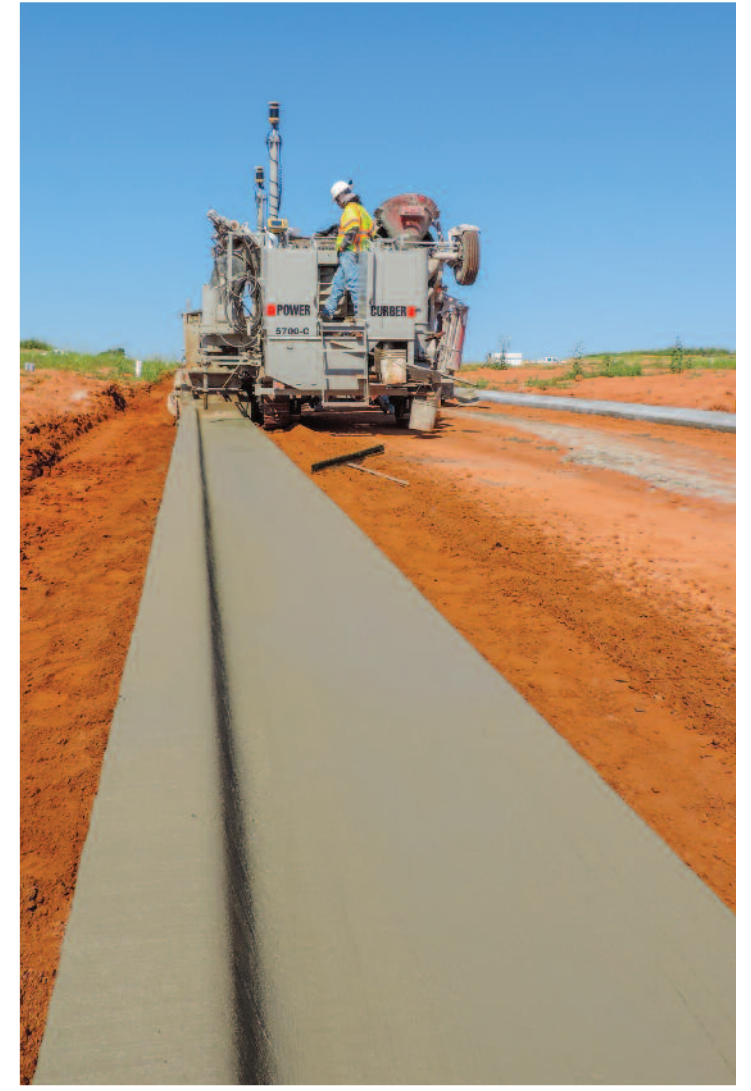
Using the Topcon Millimeter GPS system and a 3D model of the jobsite, Silver Star has eliminated the need to set and remove stringline.

"It's very hard for a crew that has set stringline their whole life to watch the machine just take off and follow the 3D guidance,"