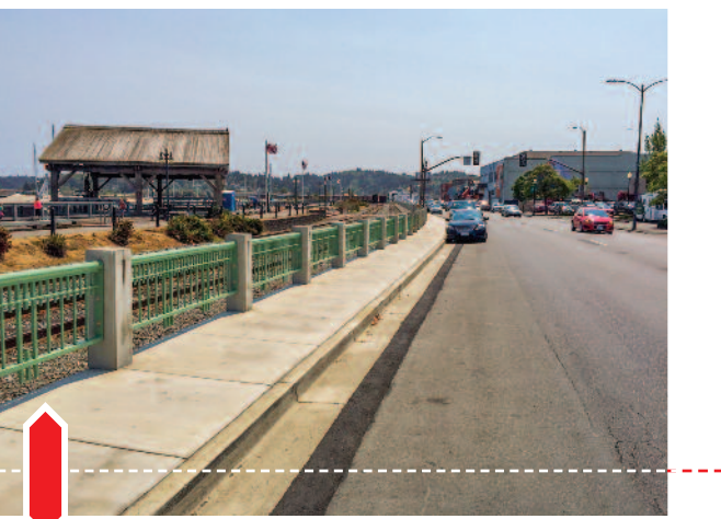
The finished product adds pedestrian walkways along the Coos Bay waterfront.