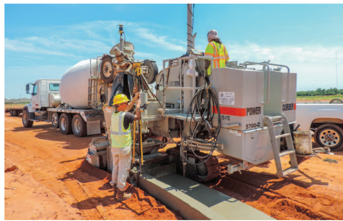
A member of Silver Star's crew uses the Topcon rover to check the accuracy of the curb.