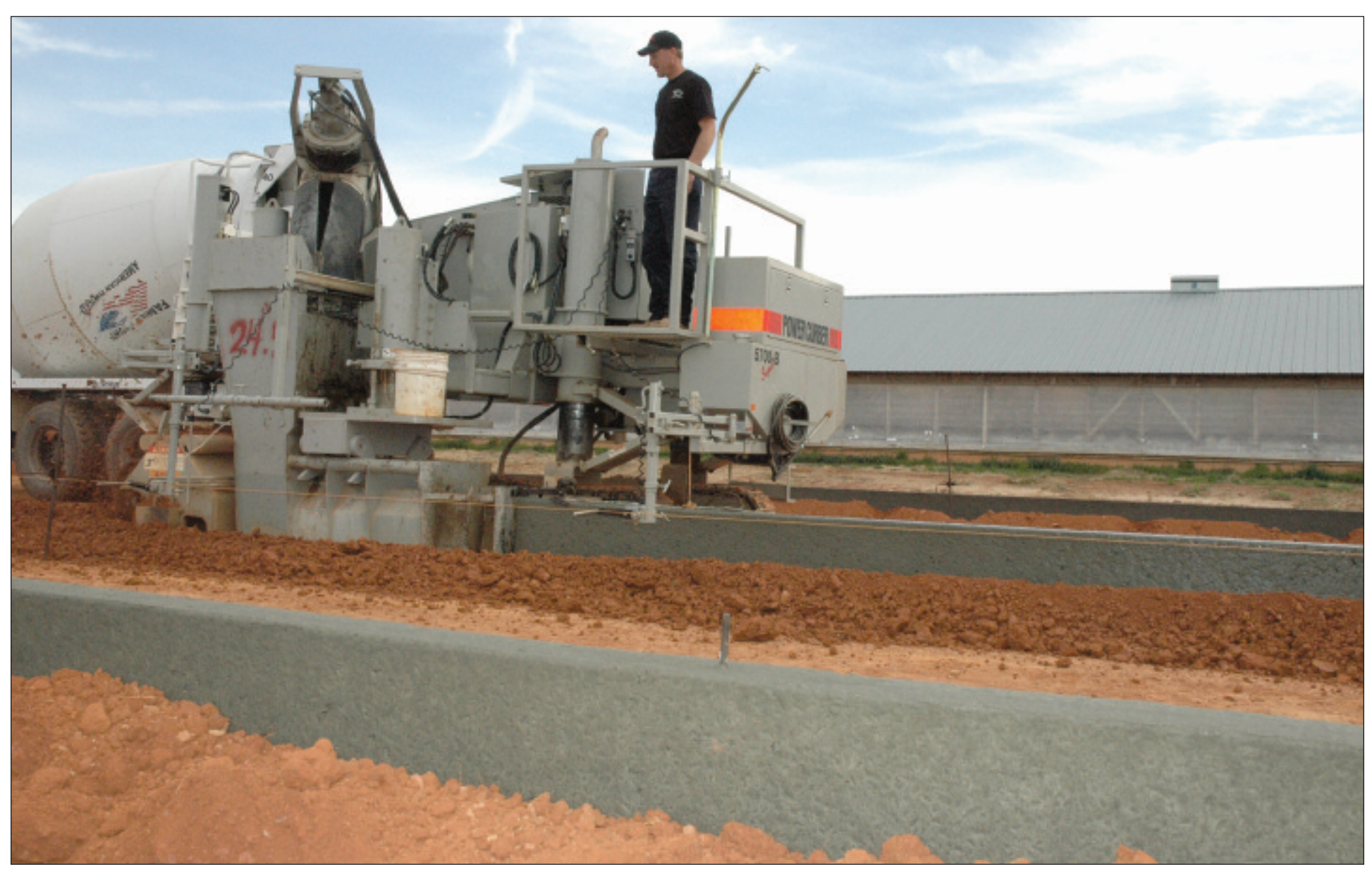
Machine operator Chuck Witfield, shown here pouring a foundation for a second chicken house at a farm in Lavonia, GA, says that foundation work is harder than curb work. The wall has to be exactly right, he says — straight and flat across the top for the framing

News and information to make you more competitive