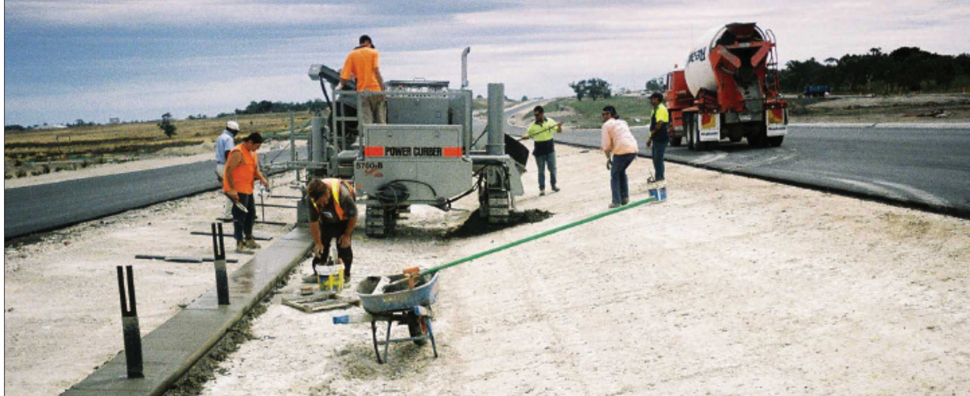
Crew knocks posts into the concrete-filled bore holes, after SUPER-B slipforms the strip. Highway safety cable will then be installed on posts. The strip prevents grass from growing under the safety cables and make road mowing easier