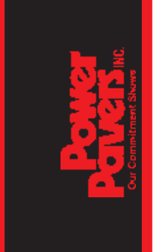
IC-2700 by Power Pavers