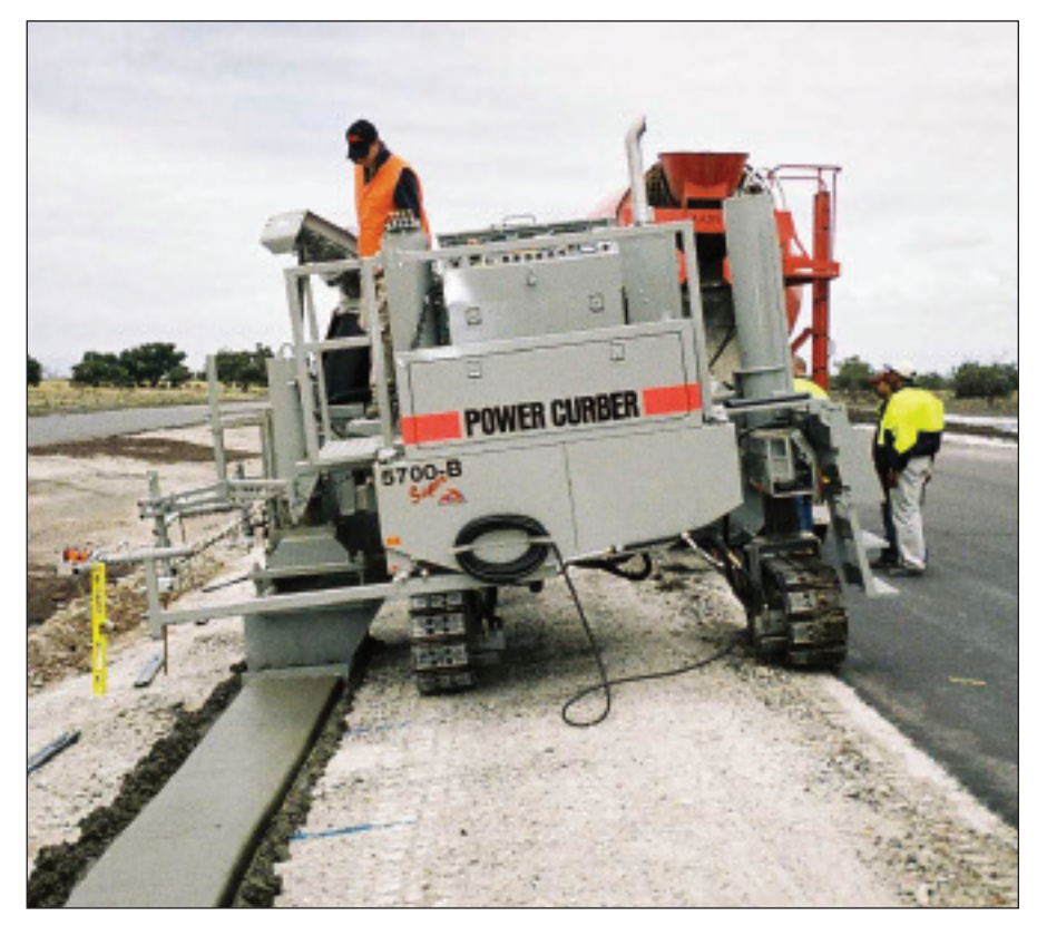
The work is fast, easy and a good money-maker

Shane Dunstan, Power Curber dealer in Australia, can be reached at 61.7.3206.3782 or shane@aran.com.au