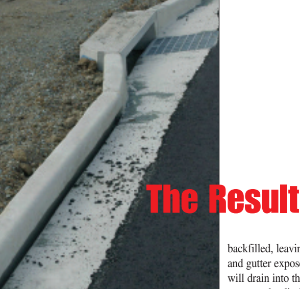
backfilled, leaving the curb and gutter exposed. Water will drain into the slot and move to the discharge area

In the final photo, the drainage side of the application has been