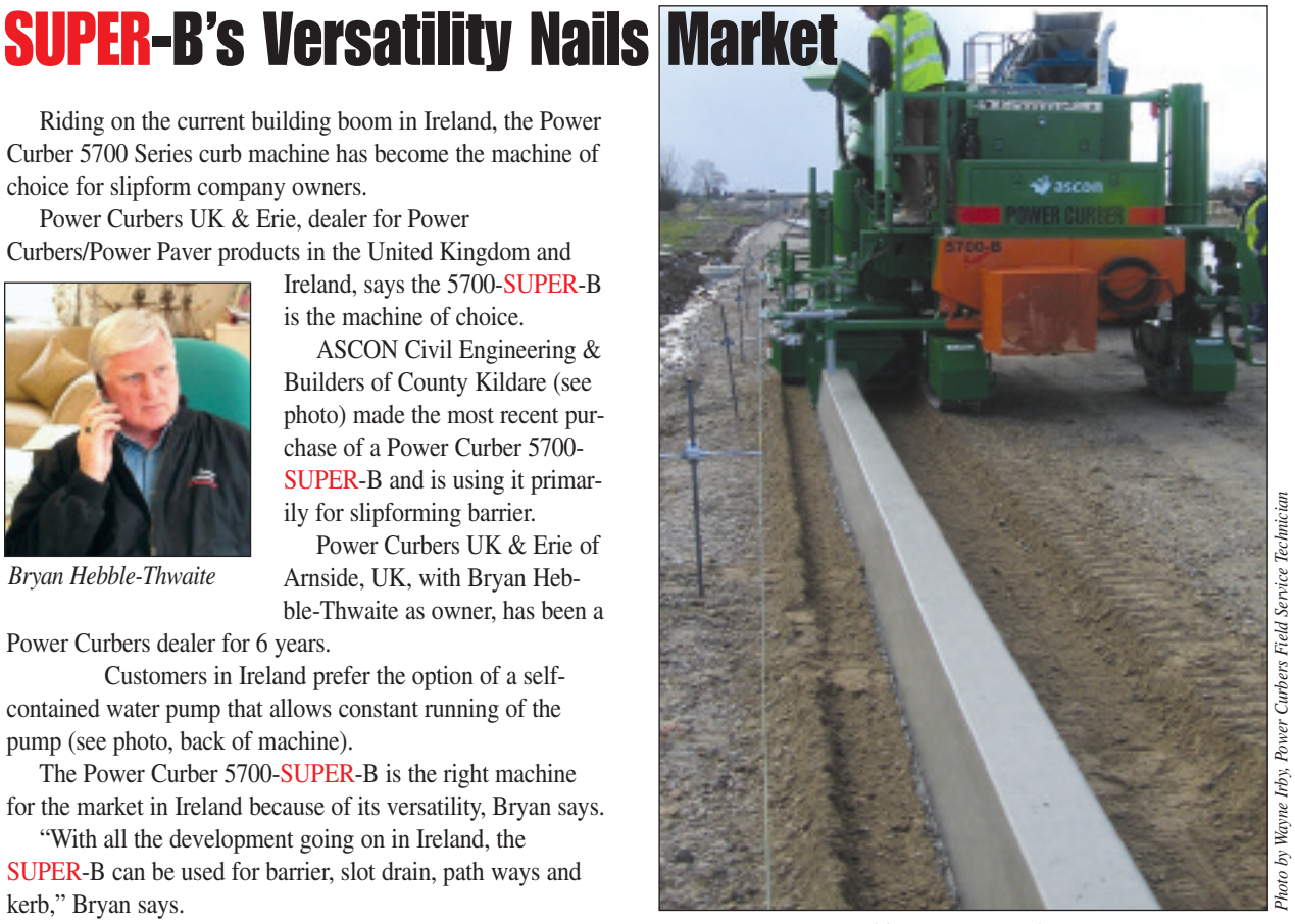
New SUPER-B owned by ASCON Civil Engineering & Builders will be used primarily for barrier

Bryan Hebble-Thwaite can be reached at 44 7785 313 290.