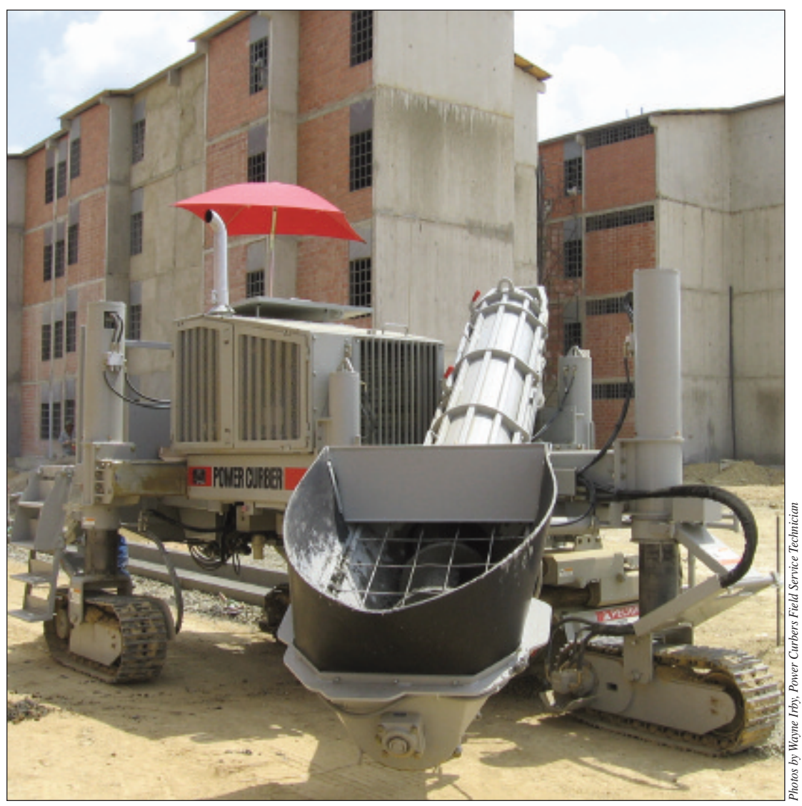
The first phase of the project involves 250 apartments