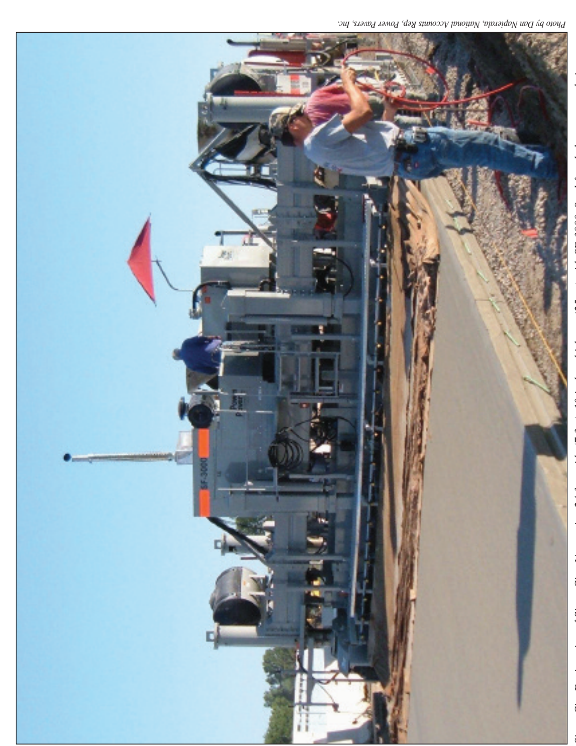
Sioux City Engineering of Sioux City, IA, paving 24 feet wide (7.3m), 10 inches thickness (25cm) with SF-3000. Steel female keyways are being inserted in the center of the slab and will tie into the next lane to lock the lanes togethe