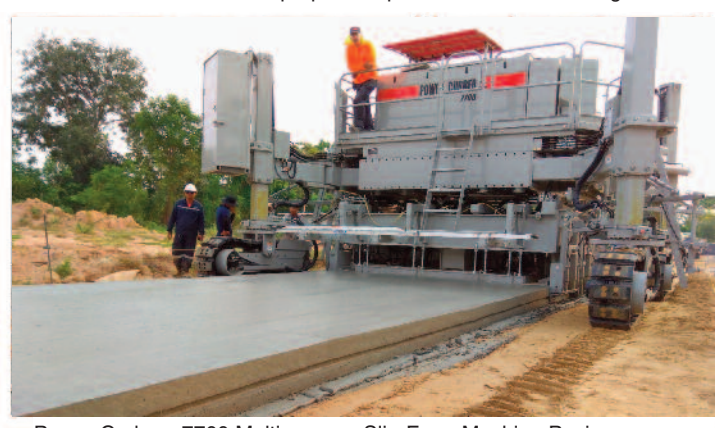
▲ Power Curbers 7700 Multipurpose Slip-Form Machine Paving