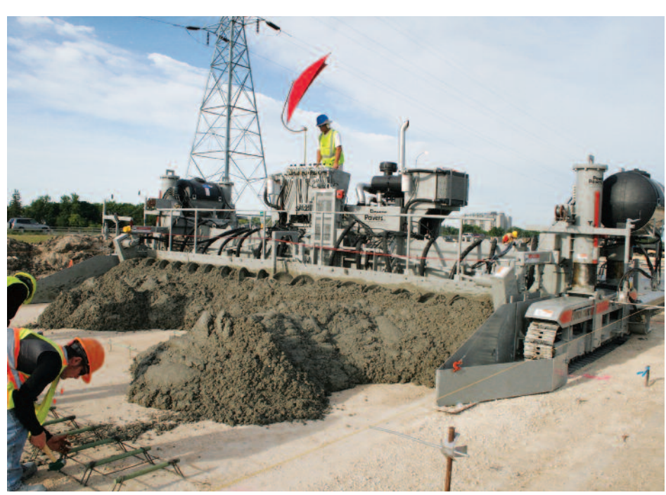
Front view of the SF-2700 paving over dowel baskets in Saskatchewan.