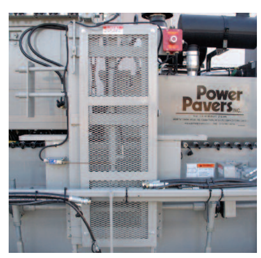
Optional center and quarter-point tie bar inserters.