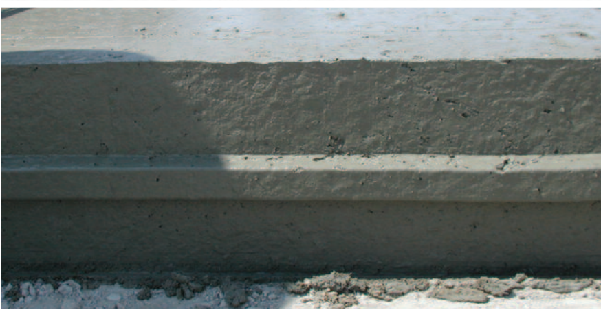
Edge of pavement with optional key-way inserter (top), and optional male key-way block-out (bottom).