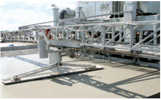
Optional final finisher features an oscillation mechanical float.