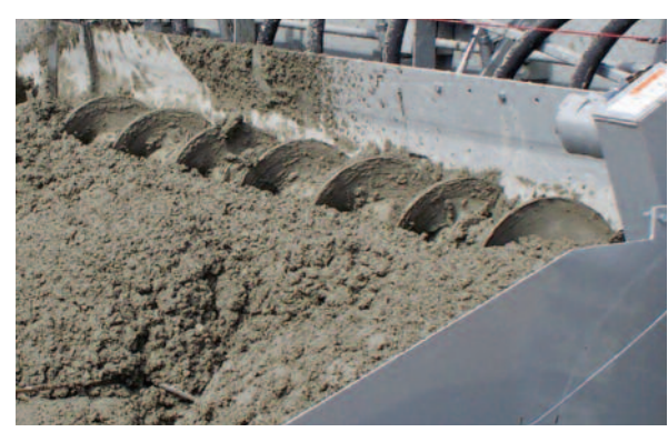
The spread auger and strike-off plate.