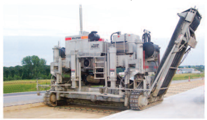
▲ Power Pavers PS-2700 and PS-3000 Belt Placer/Spreaders