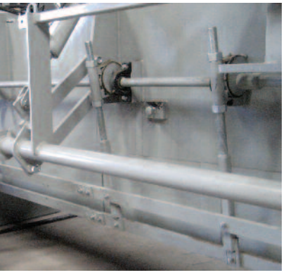
Tamper bar and vibrator mount/lift.