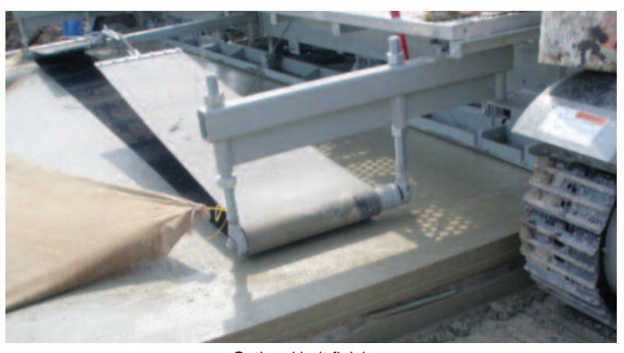
Optional belt finisher.