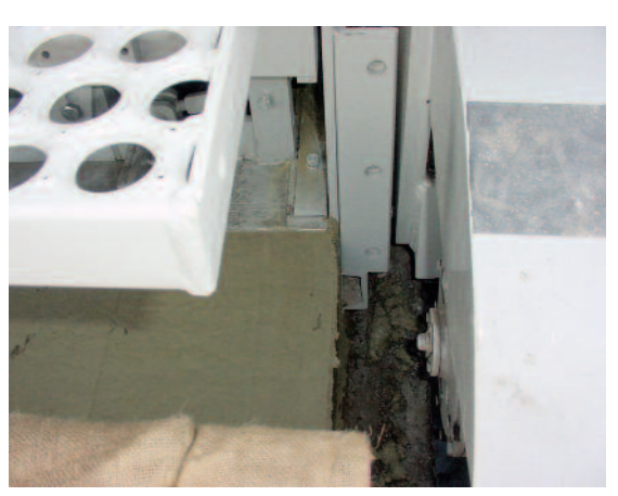
The side-forms are connected to the tracks.