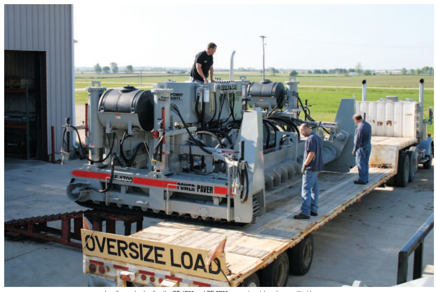
Loading and unloading the SF-1700 and SF-2700 pavers is quick and easy with side ramps.