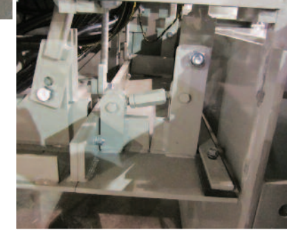
Everything works together to create pavement with a smooth flat finish with a sharp edge (top). Edge overbuild feature compensates for edge slump (bottom).