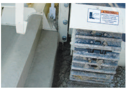
An optional curb mold, even for specialized profiles, can add integral curb to one or both sides of the pavement.