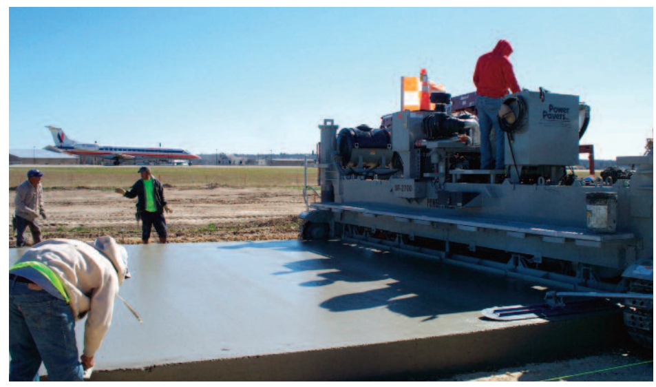
SF-2700 paving an airport.