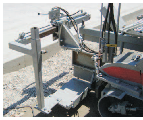
Optional hydraulic side bar inserter. A manual version is available too.