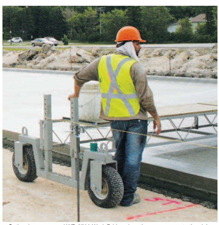
Optional non-powered WB-2700 Work Bridge gives the crew access to the slab.