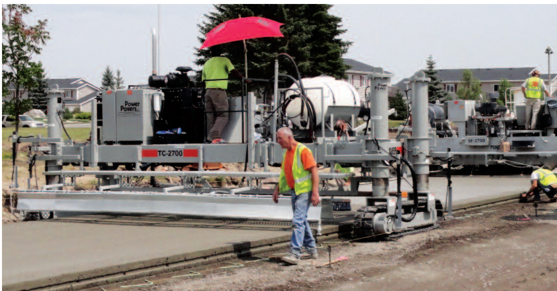
TC-2700 texture/curing machine following an SF-2700 paver.