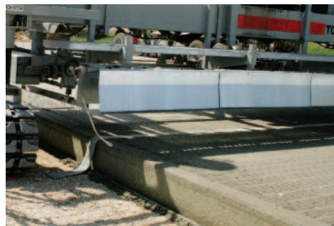
Applying a transverse tining finish.