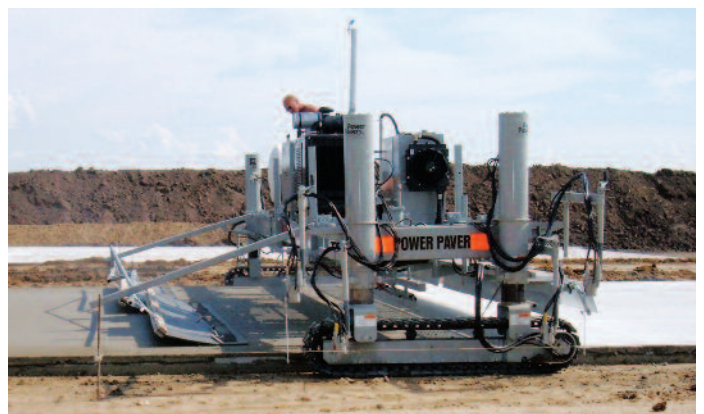
The front drag feature is being used for an astroturf drag while the curing compound is sprayed at the back.

At the front of the machine, the burlap drag with hydraulic lift allows the operator to easily adjust the height of the drag on the go. A water misting system is available for added versatility.