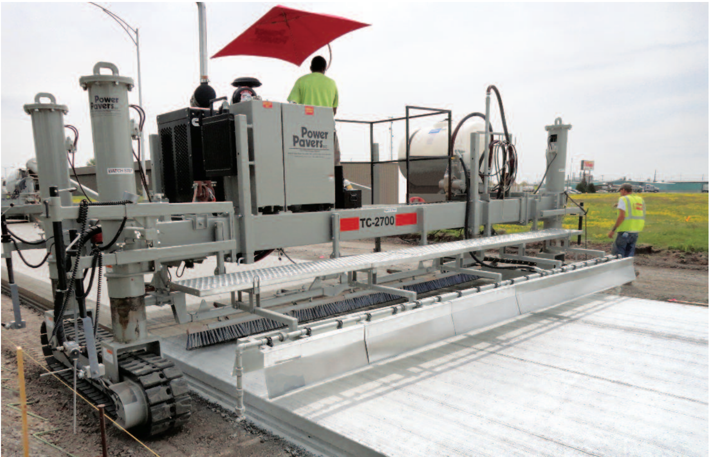
TC-2700 in North Dakota applying a broom finish and spraying curing compound onto the new paving.

The Power Paver TC-2700 is your choice for smooth, straight grooves and consistently sprayed curing compound across the slab and along the sides. The robust machine provides a stable platform for the tining system. This, and a smooth propel system through all speed ranges, make the TC-2700 the best all around texture/curing machine on the market.