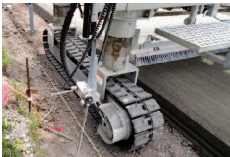
Applying a longitudinal broom finish.